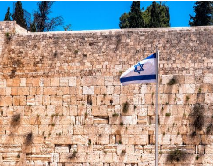
David Ben Gurion: