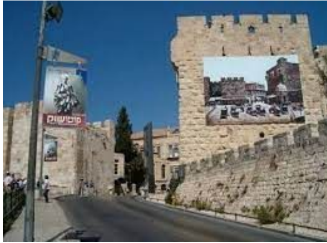
Benjamin Ze'ev Herzel

Israeli flag at the Western Wall in Jerusalem: