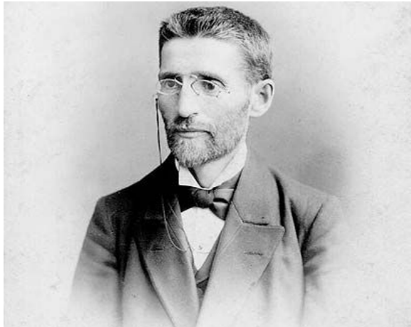
Eliezer Ben Yehuda

Ancient Hebrew was renewed from biblical times to the present day by a man named Eliezer Ben Yehuda. Today “modern” Hebrew is spoken by 9 million people.